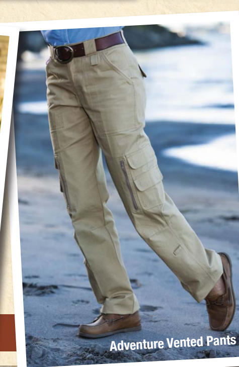
Adventure Vented Pants