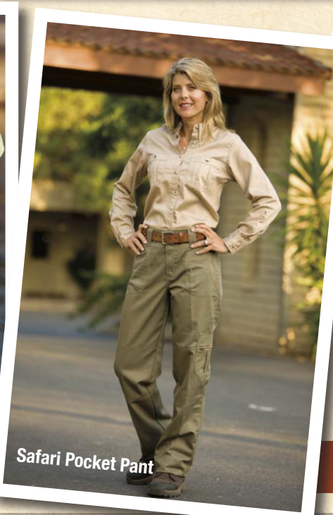
Safari Pocket Pant