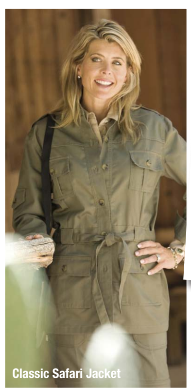
Classic Safari Jacket