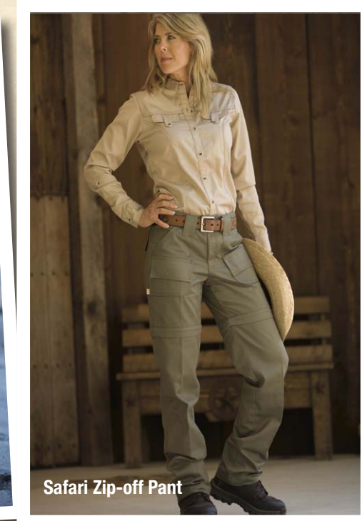
Safari Zip-off Pant